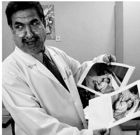
A doctor at a maternity ward in the state of Musanna shows photos of deformed babies born after the start of the Iraq War

Only the US and the UK are known to have fired it in warfare. It was used in the 1991 Gulf War, in the 2003 Iraq War, and also in Bosnia-Herzegovina in the 1990s and during the NATO war with Serbia in 1999. While its use has been claimed in a number of other conflicts, this has not been confirmed.